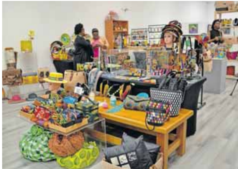
■ The craftwork on display at the Galleria mall market.

Situated next to The Hub at Galleria Mall, the craft market is part of the municipality's "Support and Buy Local" initiative. It's an exciting space showcasing an array of locally crafted goods, from woven baskets and leather bags to African-inspired fashion, beaded candles, wellness items, and fine art curated from the Durban Art Gallery. Here, shop-