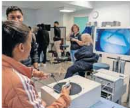
UKZN students and staff gaining hands-on experience using the new endoscopic equipment they received recently.