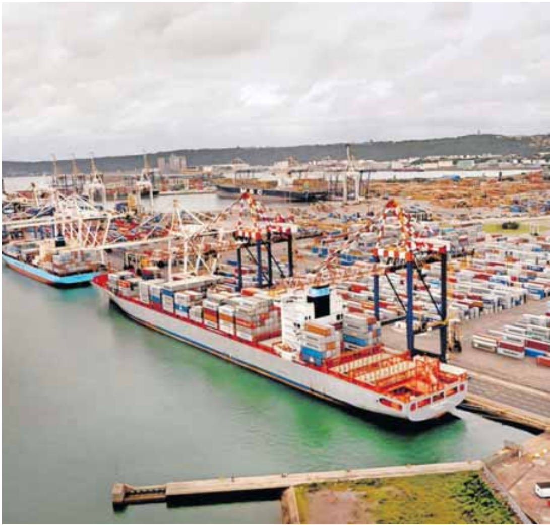
■ Transnet National Ports Authority has appointed Zutari for the implementation plan for the Port of Durban. Full story on page 2