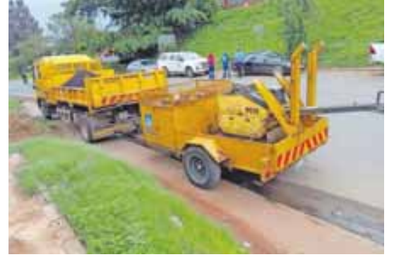
A municipal truck and equipment were recovered from six employees who were caught stealing asphalt tar in Inanda.

"The team quickly acted on the information received and tactically monitored the movement of the two identified vehicles and suspects. They followed the vehicles for hours until they stopped in Ezimangweni,