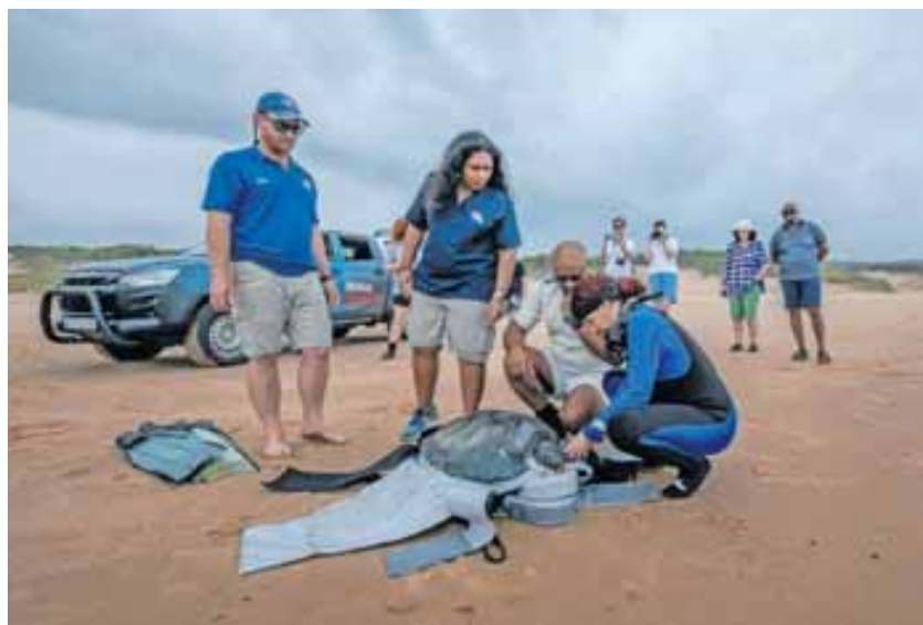
Teams from the Two Oceans Aquarium Foundation, SAAMBR and Ezemvelo prepare Bokkie for release.