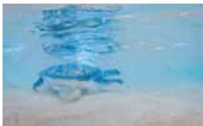
Bokkie, an amputee green turtle takes the plunge into the warm waters of the Indian Ocean at Sodwana Bay, part of the iSimangaliso Marine Protected Area.

"We are thrilled to be working with SAAMBR, iSimangaliso, and Ezemvelo KZN Wildlife, and look forward to building this network of conservation organisations," said