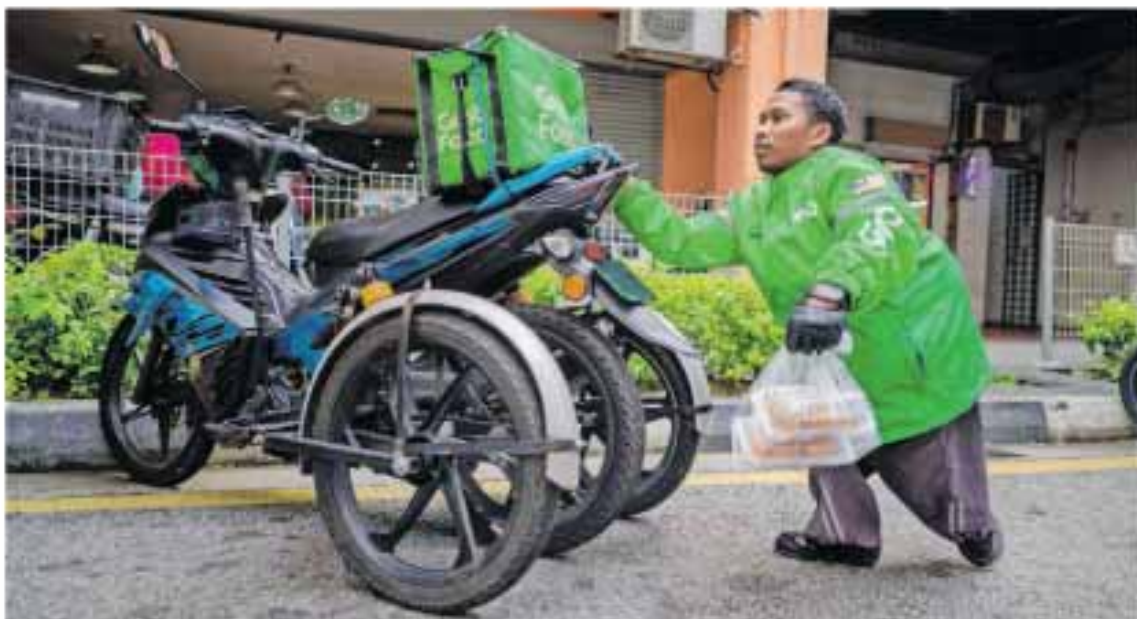
Disability Rights Awareness Month is marked from November 3 to December 3 and Minister Sindisiwe Chikunga has called all South Africans to champion the rights of people with disabilities and work towards a country where dignity and equality are universal.

The purpose of the United Nations Convention on the Rights of Persons with Disabilities (CRPD) is to promote, protect and ensure the full and equal enjoyment of all human rights and fundamental freedoms by all persons with disabilities and to promote respect for their inherent dignity, Ms Chikunga said.