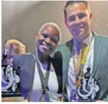
Tops sportspeople awarded page 12 >>